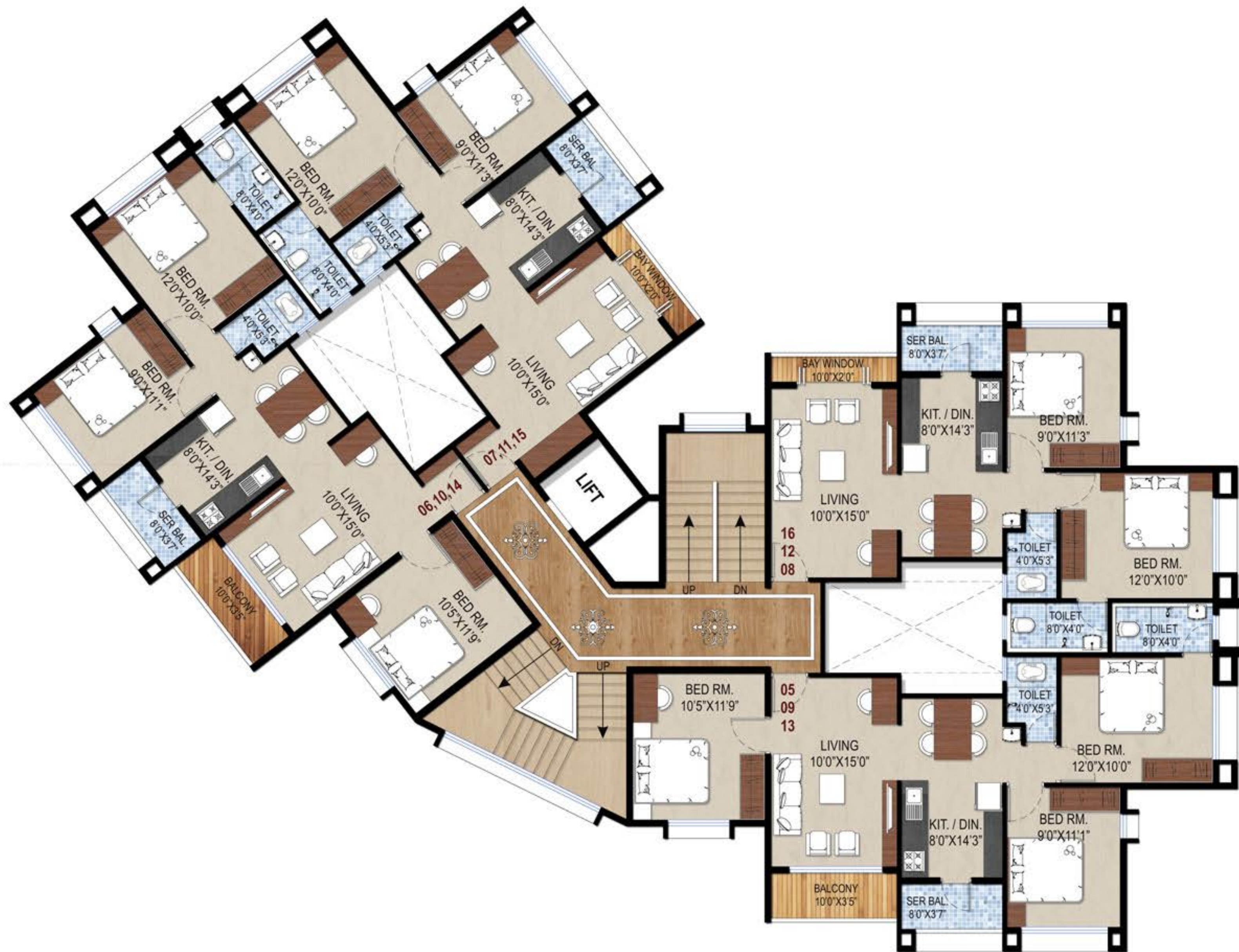
SECOND / THIRD & FOURTH FLOOR PLAN