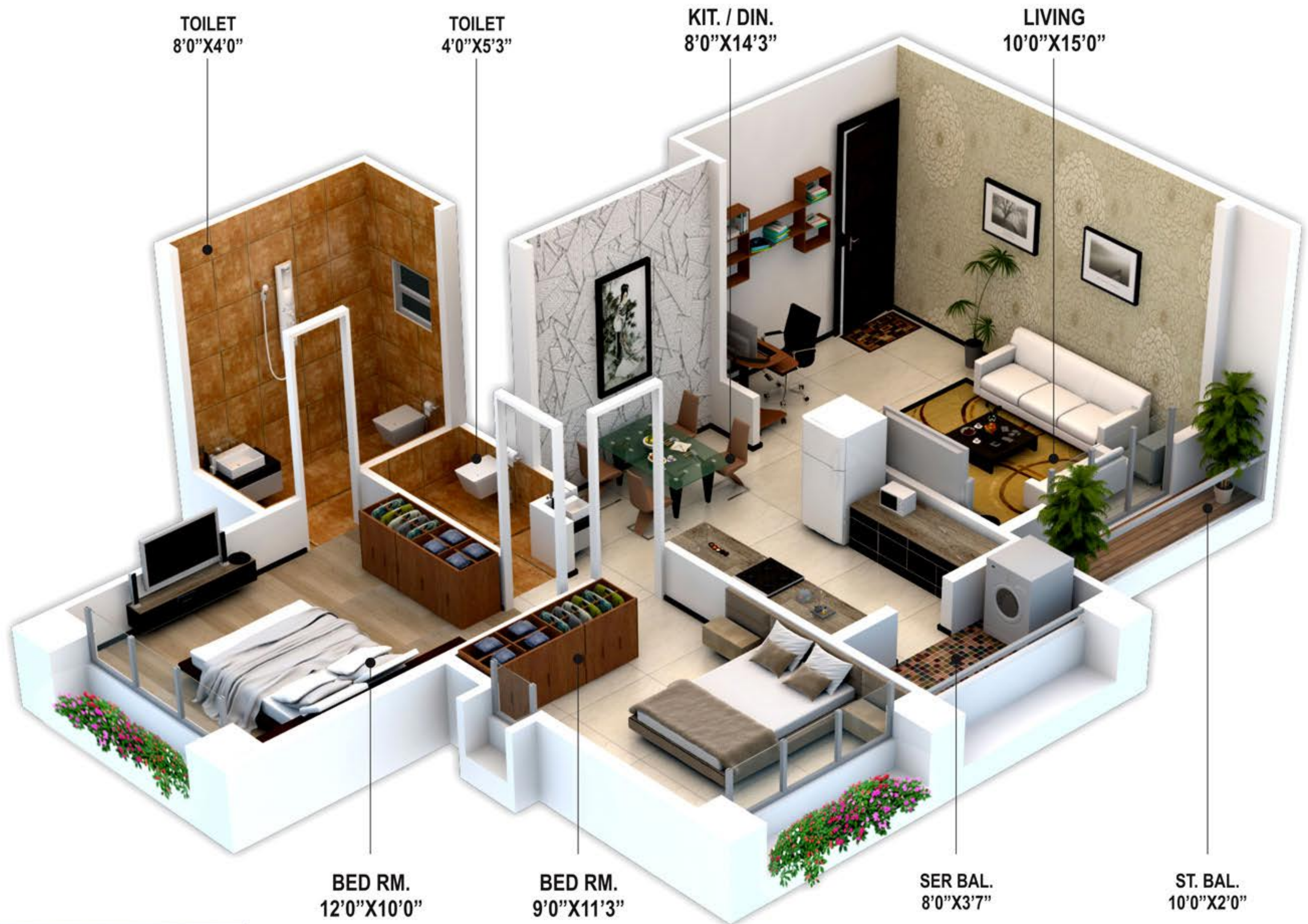
2 BHK INTERNAL VIEW