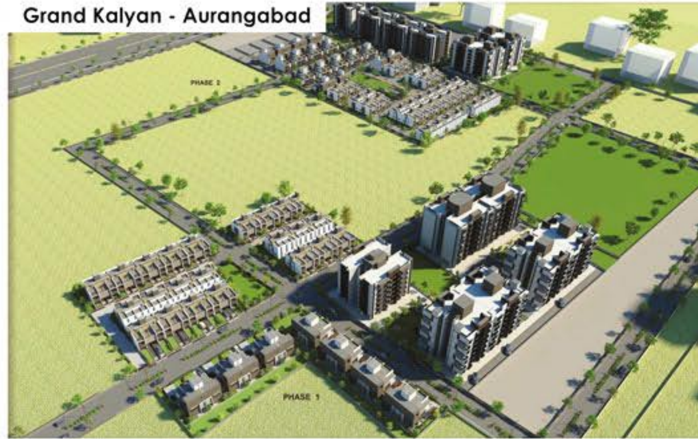
Grand Kalyan - Aurangabad