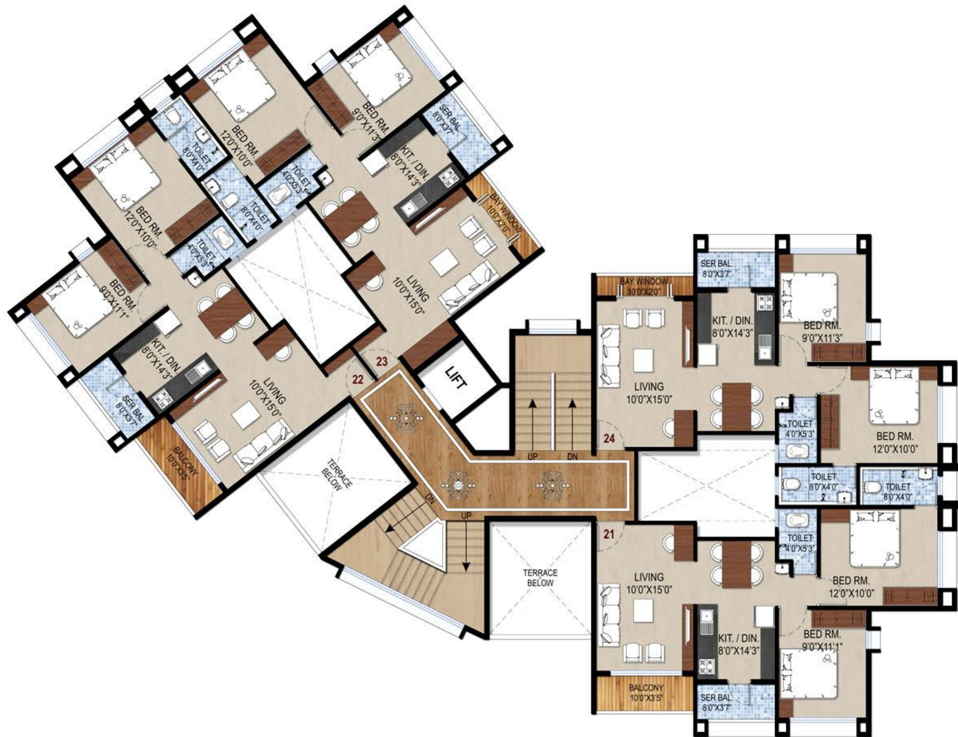
SIXTH FLOOR PLAN