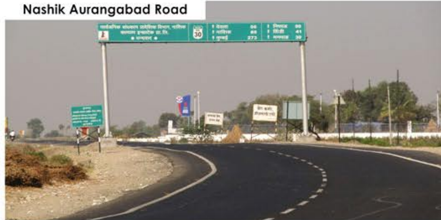
Nashik Aurangabad Road